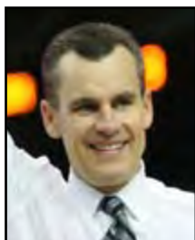
Billy Donovan Men's Basketball