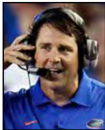
Will Muschamp Football