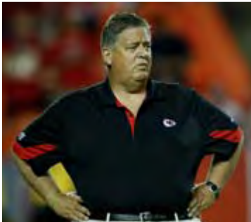
Offensive coordinator/Quarterbacks coach Charlie Weis has won four Super Bowl rings