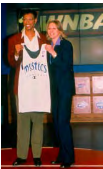
Murriel Page was the inaugural pick by the WNBA's Washington Mystics.