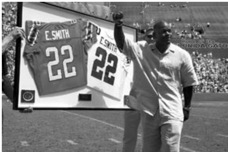
On April 12, 2003 Florida fans got the opportunity to recognize one of their own as Emmitt Smith was honored at halftime of the 2003 Orange and Blue Spring game.

Former Gator Emmitt Smith became the NFL's all-time leading rusher on Sunday, Oct. 27, 2002 with an 11-yard run against the Seattle Seahawks in Dallas. Smith surpassed the long-time record held by Walter Payton, who rushed for 16,726 yards in his 13-year.