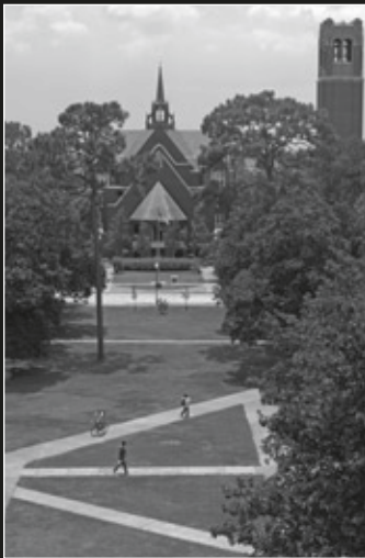
Plaza of the Americas