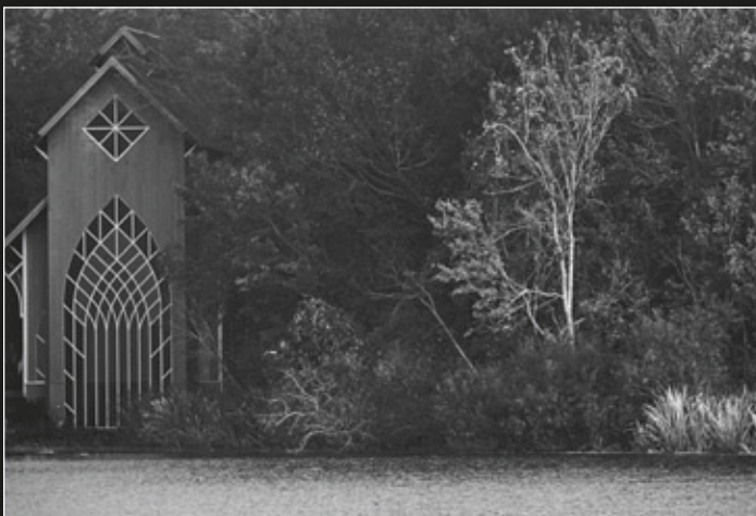
The Baughman Center, located on the shores of Lake Alice which is home to hundreds of species of wildlife, including more than 1,000 alligators, serves as a quiet study area for students and is used on special occasions.