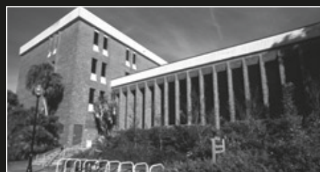
Bryant Space Science Center

UF ranked 15th among AAU public universities for endowment assets from private funds in 2003-04.