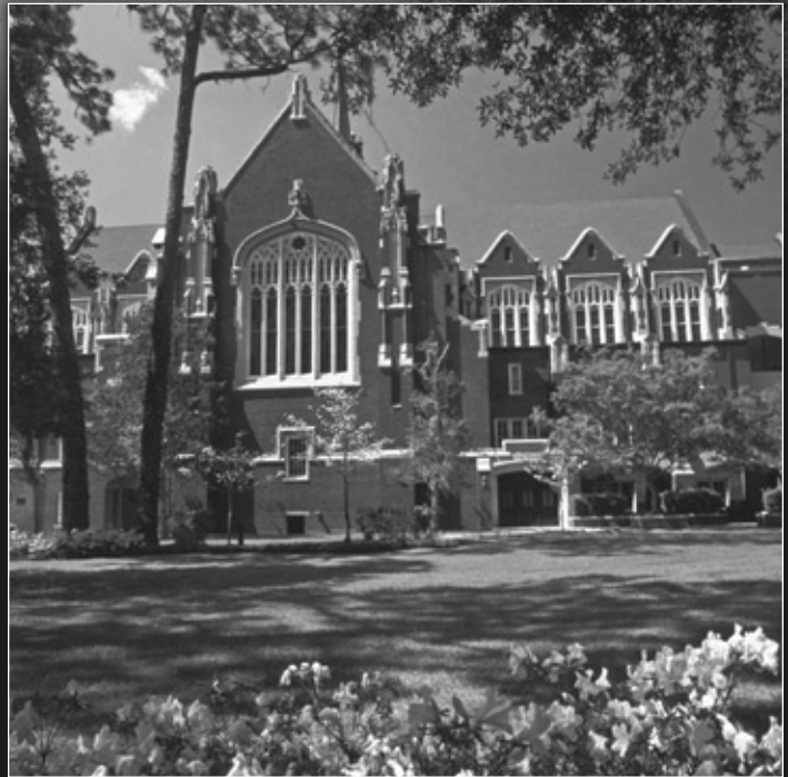
The picturesque University Memorial Auditorium has been seen in several movies, including "Just Cause" with Sean Connery and "Parenthood" with Steve Martin.