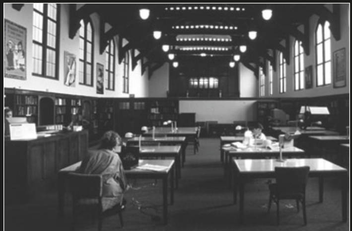
UF's libraries form the largest information resource system in the state of Florida, containing more than four million volumes, 6.3 million microfiches and thousands of full-text electronic journals.