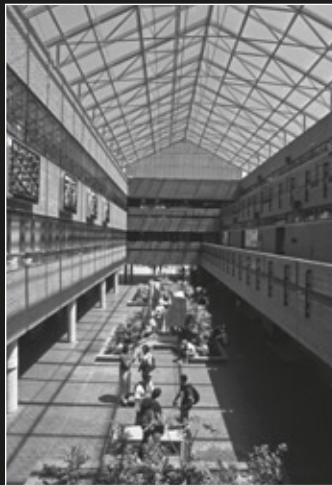
Three radio stations are broadcasted out of UF's Weimer Hall, which houses the College of Journalism.