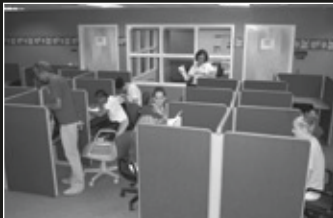
There are two computers labs inside the OSL, available only to Gator student-athletes.