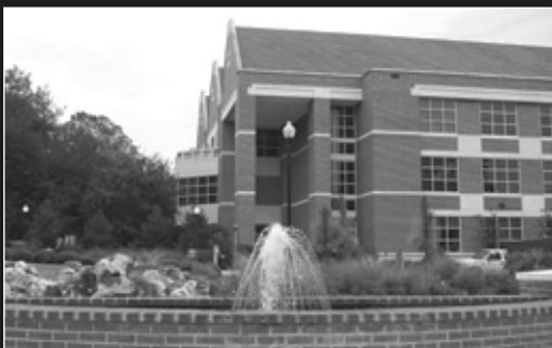
Recognizing that student-athletes face unique pressures, the University of Florida Athletic Association instituted the Office of Student Life (OSL) in 1979. The OSL, which opened in the fall of 1995, is located in the Academic Advisement Center, one block east of Ben Hill Griffin Football Stadium.

Until a student-athlete is accepted into the college of her selected major, her OSL counselor is her guide through class selection and registration. Once she is accepted into a college, class selection and registration is a combined effort between her college advisor and her OSL counselor. This double-team effort assists her until the degree is complete!