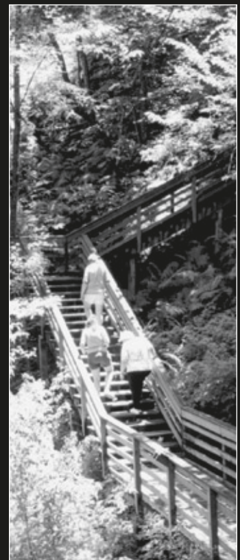
Visitors walk down 232 wooden steps to the floor of this large sinkhole known as the Devil's Millhopper. Field with lush flora and plant species, the sinkhole echoes the persistent trickle of dozens of tiny waterfalls. A visitor's center exhibits fossilized teeth, bones and marine shells from eras long ago. A nature trail, perfect for biking, winds its way around the sinkhole.