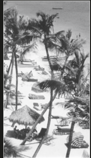
Some of Florida's most popular beaches along the Gulf of Mexico or the Atlantic Ocean are all within a short drive from Gainesville.

The average daily temperature in Gainesville is 70 degrees!