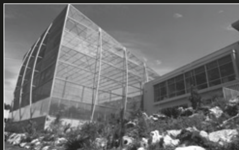
The Butterfly Rainforest is a new and permanent exhibit at the Florida Museum of Natural History located on campus. The screened vivarium houses subtropical and tropical plants and trees to support 55 to 65 different species and hundreds of free-flying butterflies. Guests can stroll through the Butterfly Rainforest on a winding path and relax to the sounds of cascading waterfalls year-round.

*according to "Cities Ranked & Rated: More Than 400 Metropolitan Areas Evaluated in the U.S. & Canada, 2nd Edition" published in May 2007